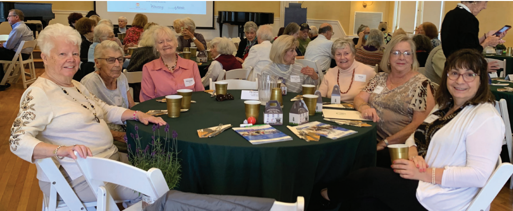
A few AHID members enjoying the Annual Luncheon at the DCA

We apologize for any omission from this listing. If an error has occurred, please contact us for future reference.