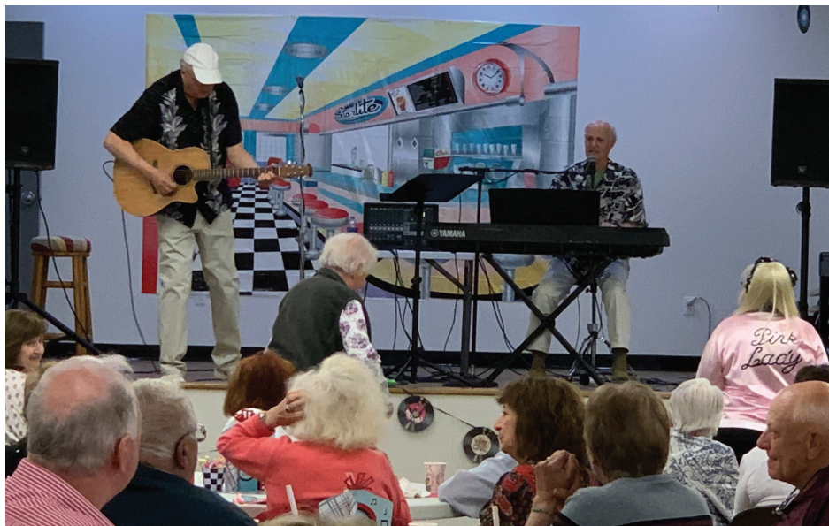
"The Elderly Brothers" entertaining guests with hits from the 1950's and 1960's at event co-sponsored by At Home In Darien and the Mather Center

In the last issue of our Out & About newsletter we spoke about the increased threat and impact of isolation and loneliness for seniors. We have