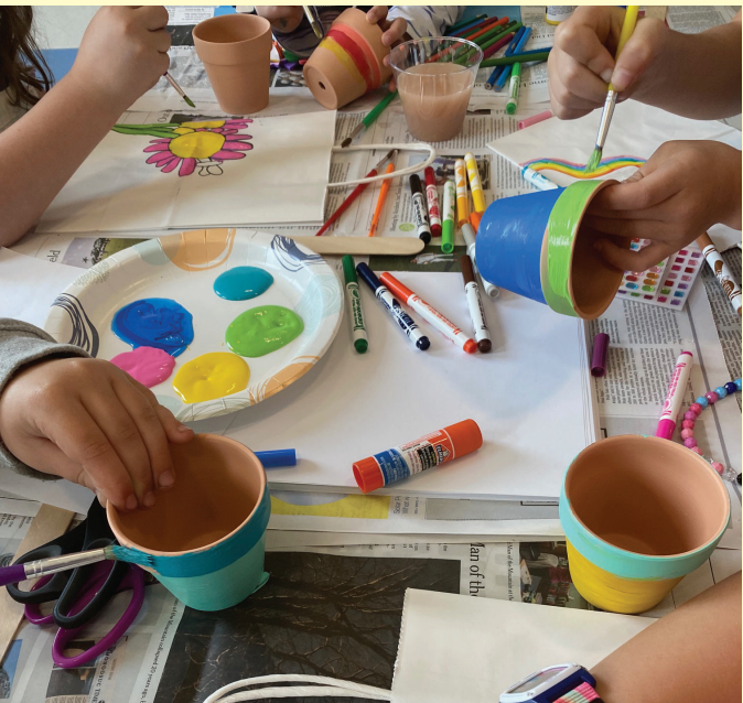
Spring flowers and decorations being made for seniors by the Royle Kids Care Club