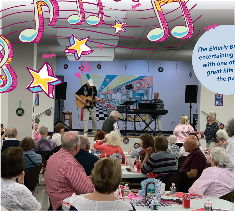
The Elderly Brothers entertaining guests with one of many great hits from the past